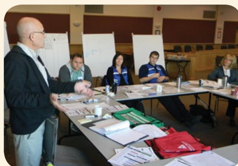
Emergency Operations Centre training.