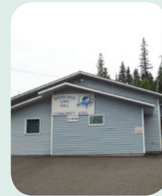
Nadsilnich Lake Hall

Community halls are located in Miworth and West Lake (Nadsilnich Lake). They are operated by non-profit societies and available for events such as dinners, meetings, special occasions and community and private functions. The halls are available for rent by contacting the Regional District office. ▲