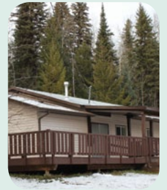
Miworth Community Hall