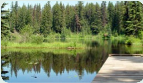
Both parks are day use only and ATVs are not permitted. ▲

Berman Lake Regional Park is located 45 kilometres west of Prince George via Highway 16 and Norman Lake Road. The 38 hectare park has 3 kilometres of trails that follow the shoreline and naturally formed eskers. Facilities including picnic tables, fire pits, toilets, change houses, canoe launch and a beach with a swimming area.