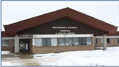
Mackenzie & District Hospital