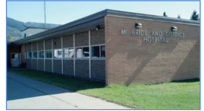
McBride and District Hospital