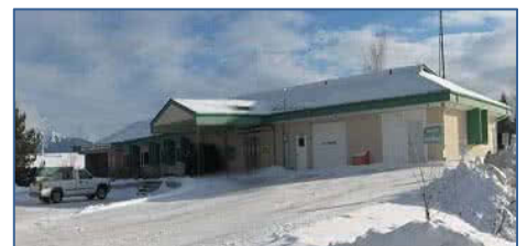
Valemount Health Centre