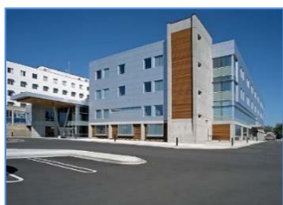
University Hospital of Northern British Columbia