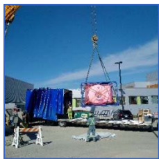
UHNBC MRI Delivery